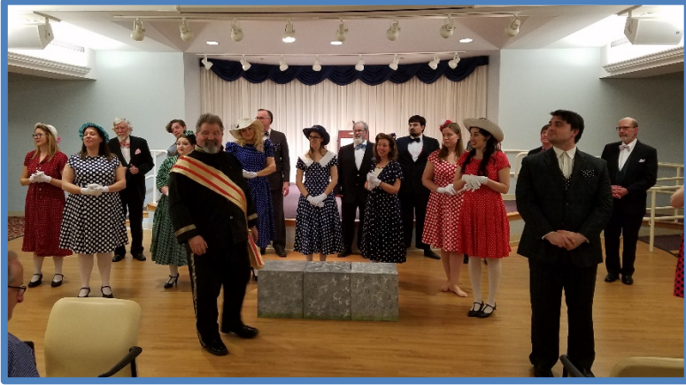
Saturday, June 1 Greater Worcester Opera Co. Performs Gilbert & Sullivan's ←The Mikado