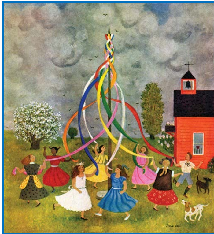
Schoolyard Maypole Dance, Saturday Evening Post cover, May 4, 1946 by Doris Lee