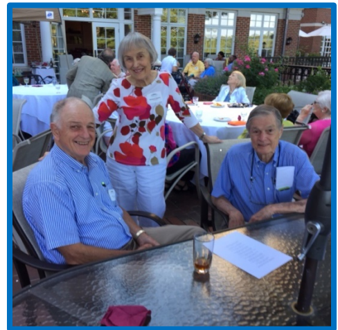
Friday, July 13 → New Resident Cocktail Social