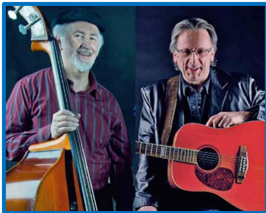
←Friday, July 20 Workingman's Duo