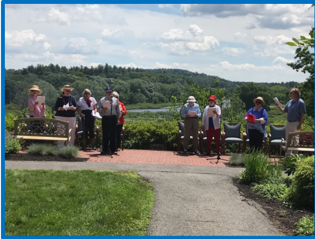
←Tuesday, July 3 Reading of the Declaration of Independence