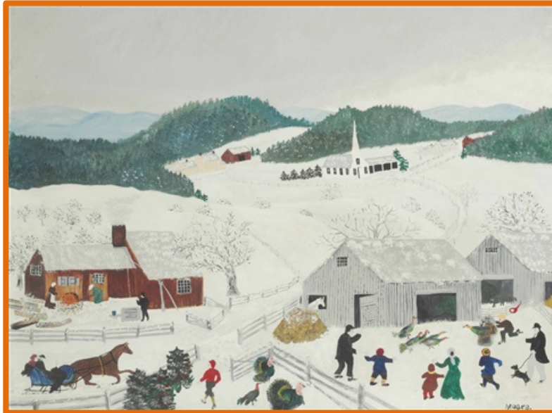
"Catching the Thanksgiving Turkey" by Grandma Moses